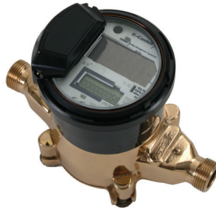
PIT SET VERSION

The E-Coder® (ARB® VII) is Neptune's next generation high-resolution solid-state absolute encoder register. The E-Coder features a custom integrated circuit design that digitally encodes the rotation of the measuring chamber providing "absolute" registration with no internal battery requirement. The E-Coder functions in two modes: E-Coder BASIC and E-Coder PLUS. The E-Coder BASIC mode functionality is the same as ProRead™ (ARB VI) featuring programmability up to a 10-digit ID number, 3 user characters, and 3-6 digit meter reading. In addition to the meter reading, the E-Coder provides a visual readout on rate of flow every six seconds when the LCD display is activated. When connected to Neptune's R900® or R450™ radio MIU, the E-Coder automatically operates in E-Coder PLUS mode, providing a high resolution, 8-digit remote meter reading, and value-added features including leak detection, tamper detection, and reverse flow detection. True point-of-use leak detection is provided by monitoring a 24-hour period in fifteen-minute intervals. Tamper detection is provided by reverse flow detection and the number of days of zero flow over the previous 35 days.