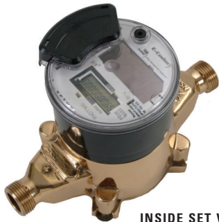
INSIDE SET VERSION