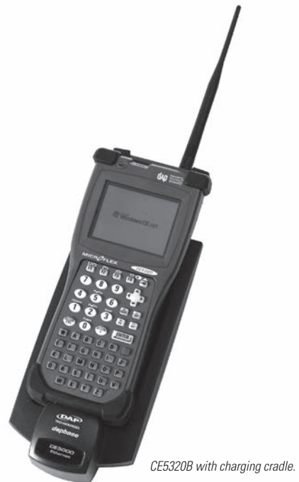
CE5320B with charging cradle.

The CE5320B incorporates an Intel® 520MHz Bulverde processor to maximize field performance. 128Mb of RAM and 256Mb of internal Flash memory provide ample storage for multiple routes of meter reading data. Communication of data from the CE5320B is conducted through an Ethernet cradle at speeds up to 10Mbps – almost 100 times faster than conventional serial communications. The cradle also serves as a charging device designed to intelligently “fast charge” the unit’s rechargeable lithium ion batteries in only four hours. The CE5320B power supply is designed to provide continuous use for a full, productive work day.