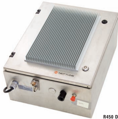
R450 Data Collector

Neptune's ARB® FixedBase™ AMI System is an advanced, highly robust, two-way fixed base meter reading solution that delivers comprehensive usage information through a secure, long-range wireless network. ARB FixedBase AMI provides the timely, high-resolution meter reading that enables water utilities to eliminate on-site visits and estimated reads, reduce theft and loss, implement time-of-use billing, and profit from all of the financial and operational benefits of fixed base automated reading and billing.